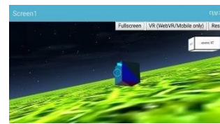
Figure 2. Scene of demo

1) and checking that the increased score is updated in the scene (⑥-2). Lastly, users can understand data by keeping track of cubes using a list block (⑦).